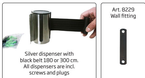
Silver dispenser with black belt 180 or 300 cm. All dispensers are incl. screws and plugs