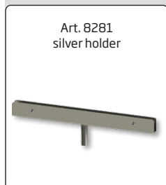
Art. 8281 silver holder