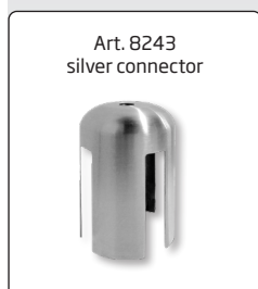
Art. 8243 silver connector