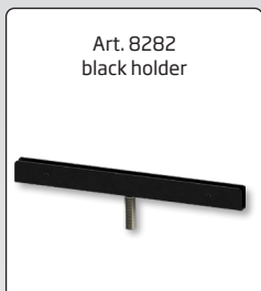
Art. 8282 black holder