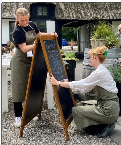
Marker pens for writing on A-boards with black boards