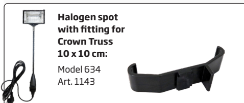
Halogen spot with fitting for Crown Truss 10 x 10 cm: Model 634 Art. 1143