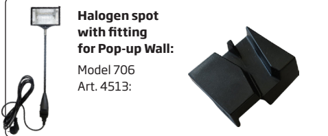
Halogen spot with fitting for Pop-up Wall: Model 706 Art. 4513: