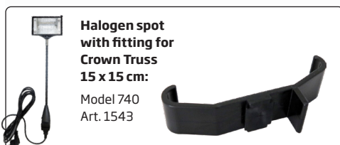
Halogen spot with fitting for Crown Truss 15 x 15 cm: Model 740 Art. 1543