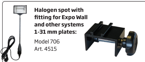
Halogen spot with fitting for Expo Wall and other systems 1-31 mm plates: Model 706 Art. 4515